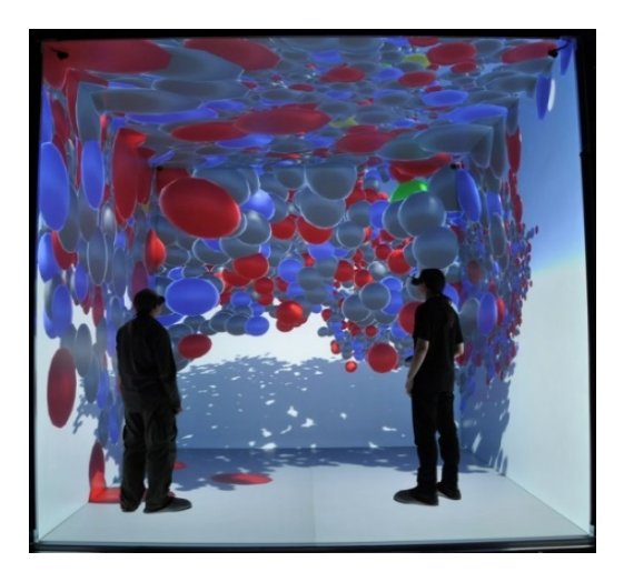
Fig. 4. Experiments with the protein's structure in the CAVE

Virtual reality has great educational opportunities. Both abstract structures (e.g. the structure of a chemical molecule, Fig. 4) and operational instruments (e.g. the principle of operation of the Geiger-Müller counter) can be shown at low cost.