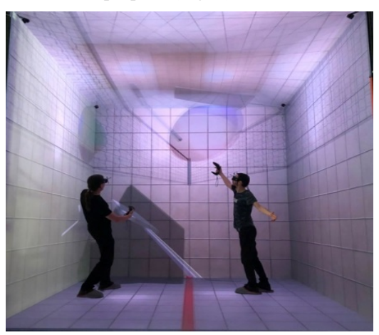
Fig. 2. Example of a CAVE Automatic Virtual Environment

training. Their realism is enhanced not only by appealing graphics but also with sound [17]. The objects viewed through head mounted displays (HMD, VR goggles, VR headsets) can be manipulated or interacted in various modes. Manipulators or gloves with sensors can be used for this purpose (Fig. 2).