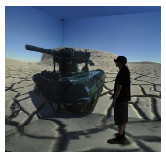
Fig. 3. Remote control vehicle mobility testing in the CAVE

before the costly production of a physical prototype. By modelling its physics, we can also check its functioning in a wide range (Fig. 3). Scenarios of rescue operations can also be modelled in a similar way.