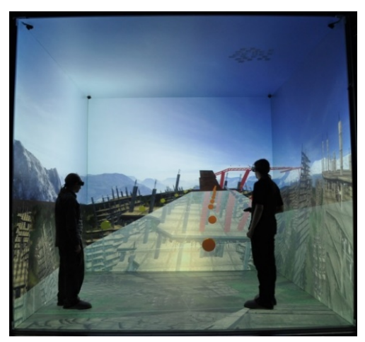
Fig. 6. Assessment of human behaviour in a stressful situation (feeling of high altitude on the glass bridge) in the CAVE

Immersive environment allows the assessment of human behaviour in various situations, including critical ones. Thanks to this, it is possible to assess the usefulness of a device in an action with a particular scenario. A simulation also enables participants to become accustomed to critical situations (Fig. 6).