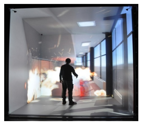
Fig. 5. Firefighting training in the CAVE

Virtual reality is a safe and relatively cheap training ground for a rescuers exposed to danger (Fig. 5). It helps improve their ability to handle physical threats.