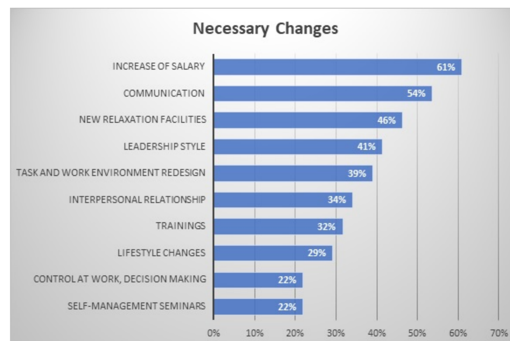
Figure 3 Necessary Changes