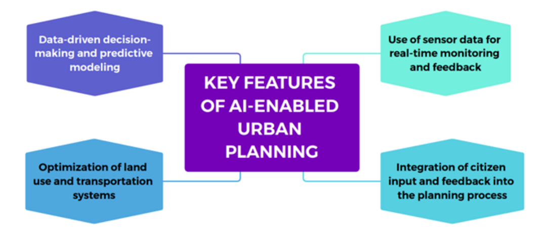
FIGURE 1. Key features of AI-enabled urban planning for smart city transitions.

Predictive modeling and data-driven decisionmaking can improve urban planning precision and effectiveness, helping planners use AI to make more informed decisions based on data rather than intuition or preconceptions. Unfortunately, AI algorithms may reflect any biases present in training data which results in decisions being inequitable or unfair [20, 21]; an over-reliance on predictive modeling may result in rigidity within the planning process as planners become overly dependent on previous data without taking into account new patterns or situations changing from what was originally planned.