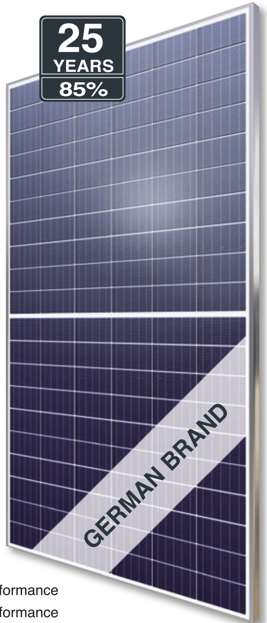
Fig. similar 120MHEN201117A

Exclusive linear AXITEC high performance guarantee!