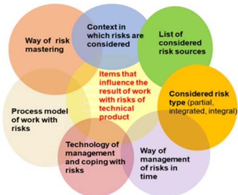
Fig. 1. The factors that influence the risk size of a given entity.