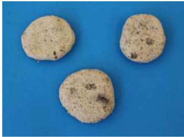
Fig. 8. Samples of plaster D dried in 65% RH, then placed in 100% RH for 4 weeks

ing three types of plant fibres) showed the lowest resistance to fungal growth as in all the environments the colonies of mould started to occur in all the samples. In the highest RH equalling 84%, the mould was even detectable by naked eye. The samples made of plaster A (with oat straw addition) had the similar fungal growth rate in all the values of relative humidity. The plaster B and C did not show any growth except in the highest RH, where the mould was visible only under a microscope.