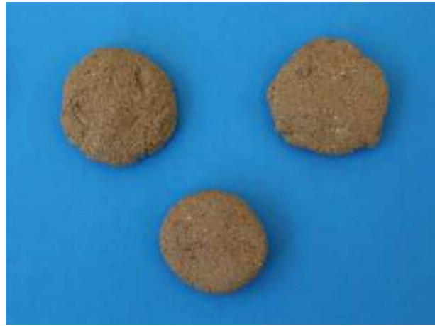
Fig. 6. Samples of plaster B dried in 65% RH, then placed in 100% RH for 4 weeks