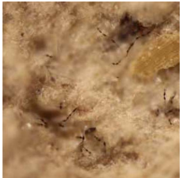
Fig. 4. Sample D dried below 25% RH, documented after 4 weeks in RH 84%, magnification 100×, colonies of Alternaria sp. visible