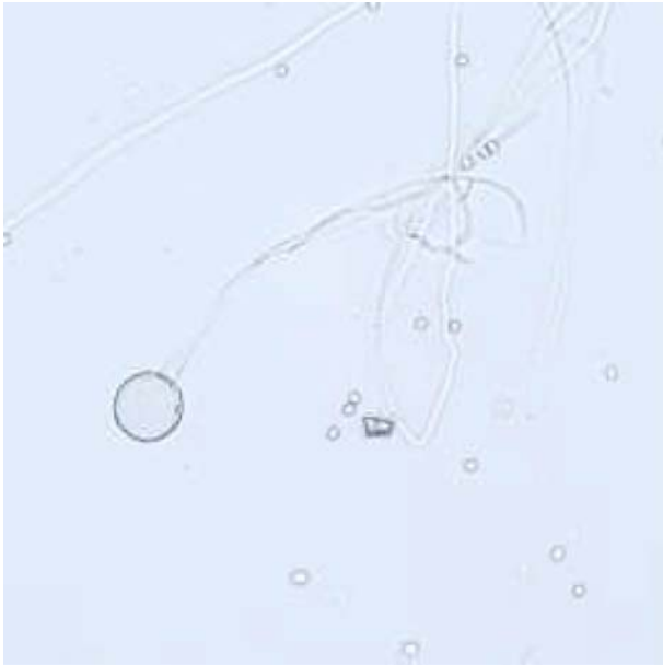
Fig. 1. Mucor sp., magnification 400×