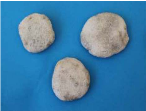
Fig. 7. Samples of plaster C dried in 65% RH, then placed in 100% RH for 4 weeks