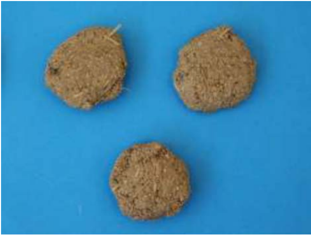
Fig. 5. Samples of plaster A dried in 65% RH, then placed in 100% RH for 4 weeks