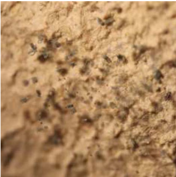
Fig. 3. Sample D dried below 25% RH, documented after 2 weeks in RH 84%, magnification 100×, grey fungal colonies visible