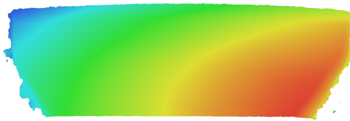
Fig. 3. Reconstructed digital elevation model.