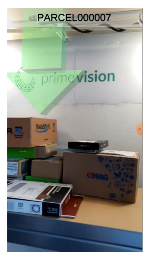
FIGURE 2. Highlighting in AR the location of the parcel to be delivered next.

The detection of 2D markers from one or multiple cameras is used to reconstruct the 3D geometry of the physical shelves and storage rack. Following this, the camera parameters are computed. A second calibration relates to a manual alignment and is done through the mobile application by adjusting the 3D position of specific key-points of the shelf. This step is necessary for fine tuning the 3D rendering. The pattern match algorithm has a multi-threaded implementation and uses scale-invariant feature transform (SIFT) descriptors for visual pattern matching. The bar-code module relies on ZXing [21], an open-source, multi-format 1D/2D bar-code image processing library. In scan mode, the sensor component uses all information about the detected parcels to generate parcel fingerprints. The segmentation of the side images of a parcel uses the algorithm of Wang and Guo [22] which reconstructs the RGB-D indoor scene with plane primitives. The algorithm estimates the entire scene by adaptive planes without losing geometry details and preserves sharp features in the final mesh. In addition to the sensor component, the SOLiD system consists of an augmented reality-based visualization component. This component is a mobile application running on the smartphone of the field delivery agent (Android device).