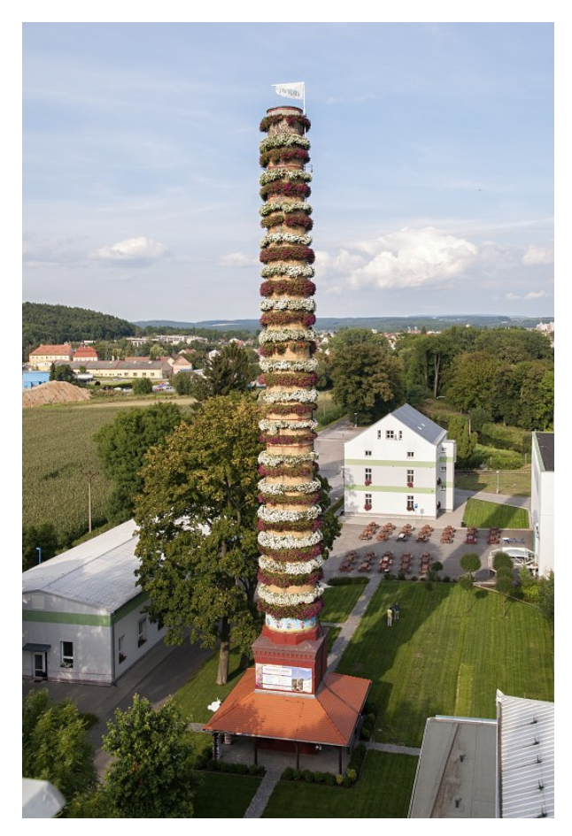
FIGURE 2. The flowering chimney in Česká Skalice (CZ), an original advertisement of the manufacturer of substrates and fertilizers.

The situation is quite different in the case of the utilitarian use of a chimney as a carrier of technical equipment, i.e. typically technology for receiving