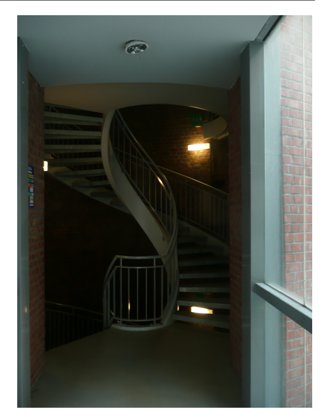
FIGURE 3. Collage of architecture (ENSA), Paris – Val de Seine (F), the staircase inside the chimney body.

Access to the interior of the chimney at only one (ground) level is relatively simple. If the entire chim-