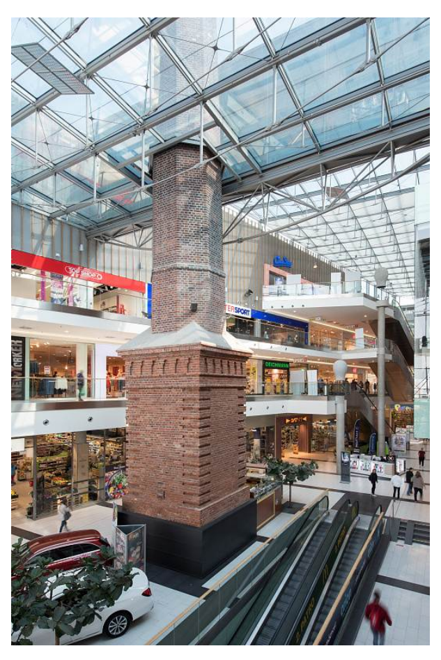
FIGURE 4. Breda shopping centre in the former brewery estates in Opava (CZ), the chimney has become part of the shopping mall interior.